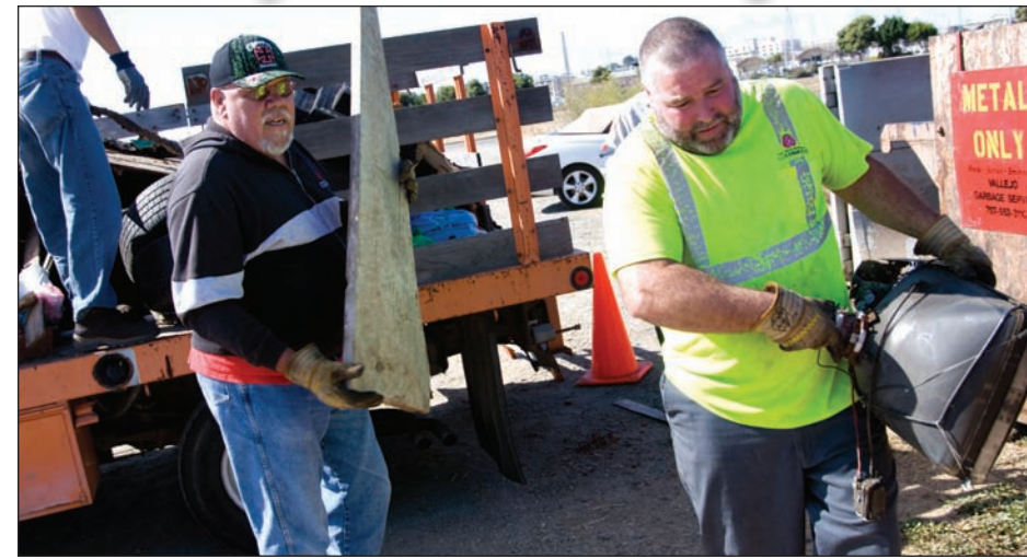
Last year's Coastal Cleanup Day in Vallejo (pictured above) brought out over 400 volunteers who removed 37,000 pounds of debris from waterways around Vallejo.

Residents, community organizations, and non-profit groups may pick up free paint at the VGS Recycling Facility, 2021 Broadway in Vallejo. The facility is open from Thursday through Saturday from 8 AM until 4 PM. The paint is created from supplies that were delivered to the Recycling Facility for recycling. Paint quantities are limited, but there is currently a large supply on hand. Commercial uses are not allowed.