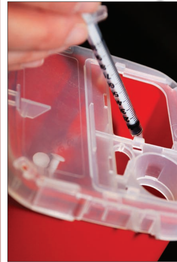
Place your sharps into FDA approved containers like the one pictured above. When full, bring the containers to the Vallejo-Napa Household Hazardous Waste Facility.

A new California law now restricts hypodermic needles, syringes or lancets from disposal in garbage cans or recycling containers. A growing number of people are using injectable medications for chronic conditions.