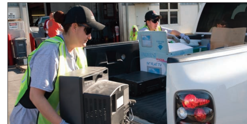
Vallejo Garbage Service employees unload electronics that were collected during the E-Waste and Used Tire Recycling Day that was held on April 26. Many Vallejo commercial customers participated in the free event. If you missed it, VGS has a wealth of resources that can help with disposal and recycling options during the year. For information contact us at 552-3110.

Your used sharps should be securely contained in a FDA approved container. The approved containers are available for sale at many drug stores and may also be available through your health care facility. An acceptable alternative is to place the sharps into the container they were supplied in or into a metal coffee can that has a tight fitting lid. The HHW Center in American Canyon allows the use of any of these disposal containers.