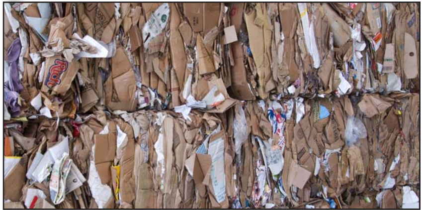
The value of cardboard has risen to a record high. The increased value has also brought an increase in the theft of cardboard in Vallejo.

Reselling the cardboard and other recyclable materials helps to offset the cost of the commercial recycling program, but the rash of stolen materials is creating a serious problem. Vallejo business owners know that a