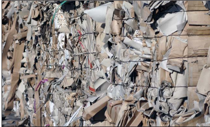
The cardboard above is baled and stacked waiting to be sold to vendors. These sales help offset the cost of the collection program.